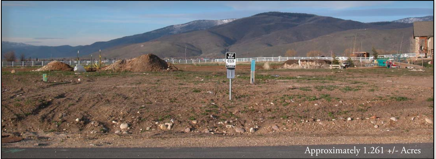
Approximately 1.261 +/- Acres

Approx. 15 minutes East from World Famous Park City and Deer Valley Resort, Utah