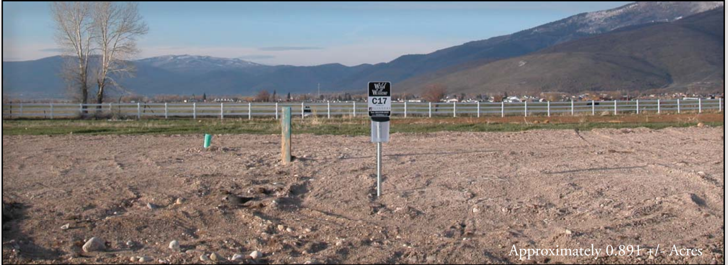
Approximately 0.891 +/- Acres

Approx. 15 minutes East from World Famous Park City and Deer Valley Resort, Utah