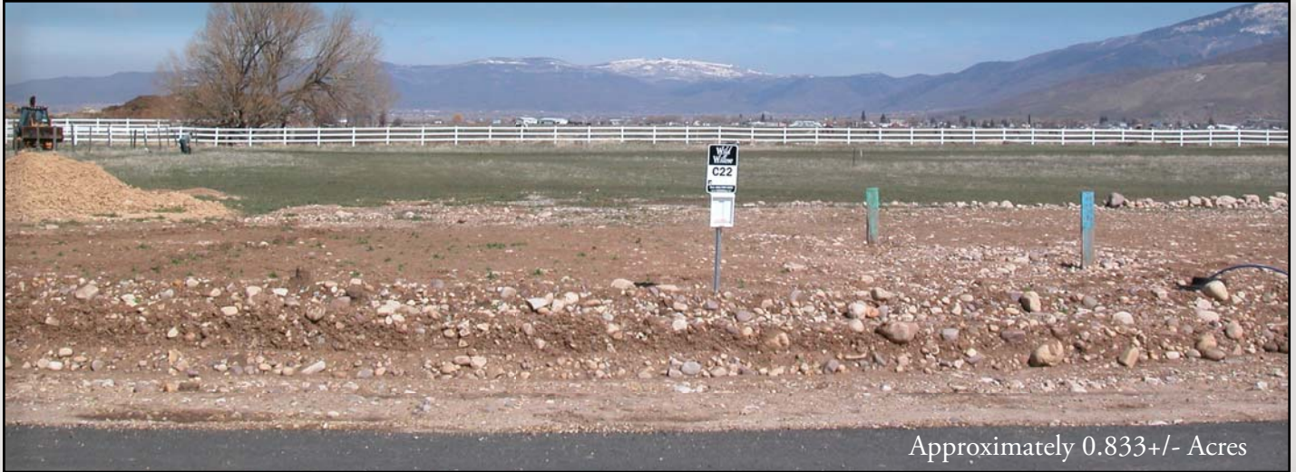
Approximately 0.833+/- Acres

Approx. 15 minutes East from World Famous Park City and Deer Valley Resort, Utah