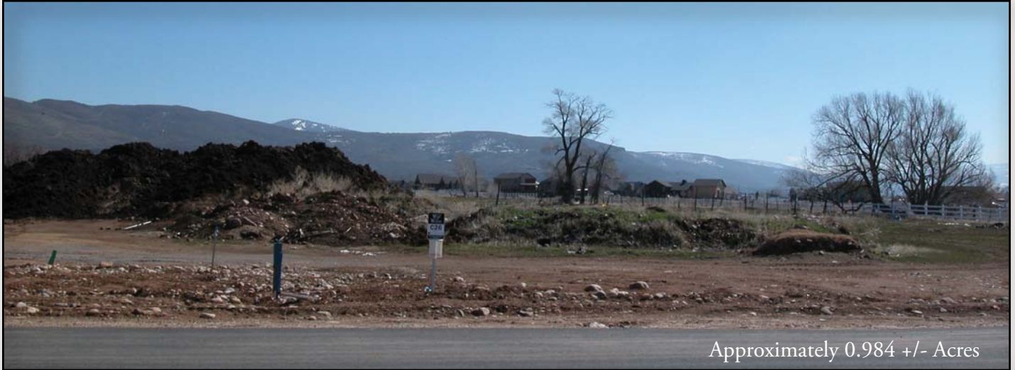
Approximately 0.984 +/- Acres

Approx. 15 minutes East from World Famous Park City and Deer Valley Resort, Utah