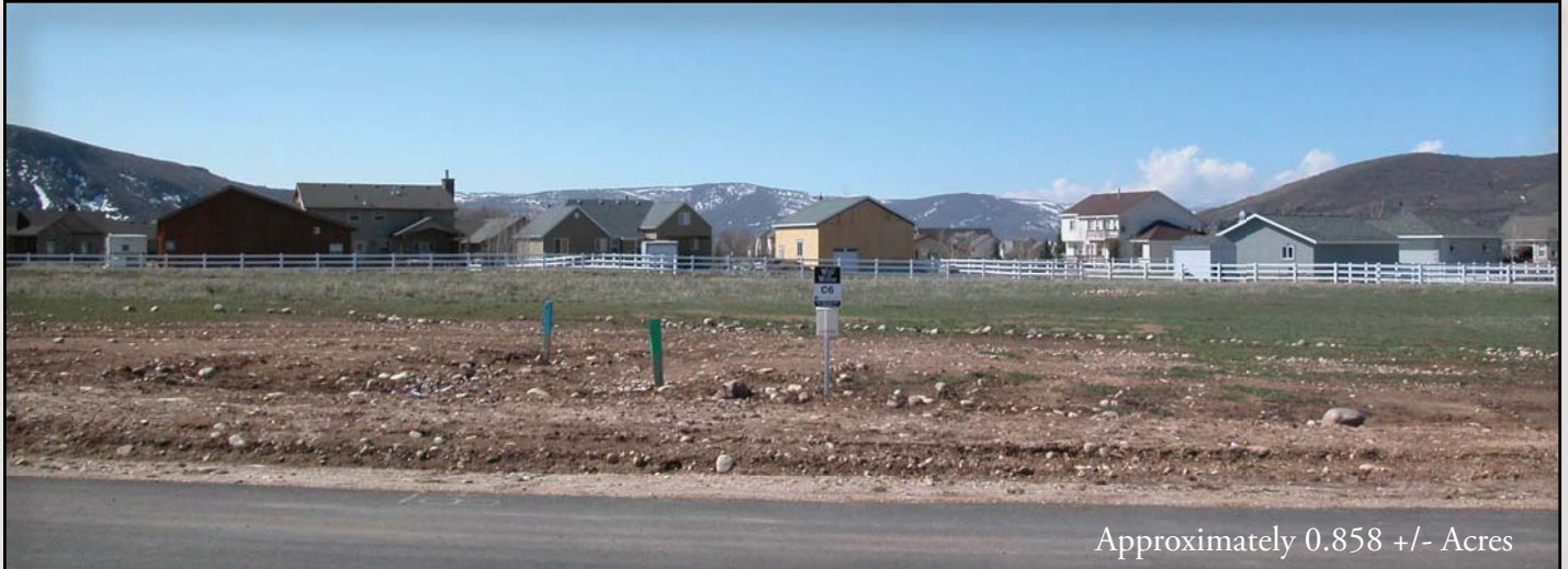
Approximately 0.858 +/- Acres

Approx. 15 minutes East from World Famous Park City and Deer Valley Resort, Utah